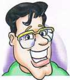
a famous actor