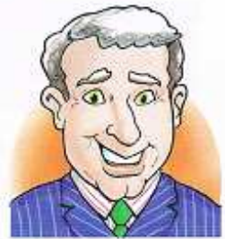
the president* of your country