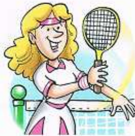
a famous athlete