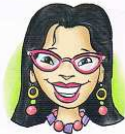
a famous actress